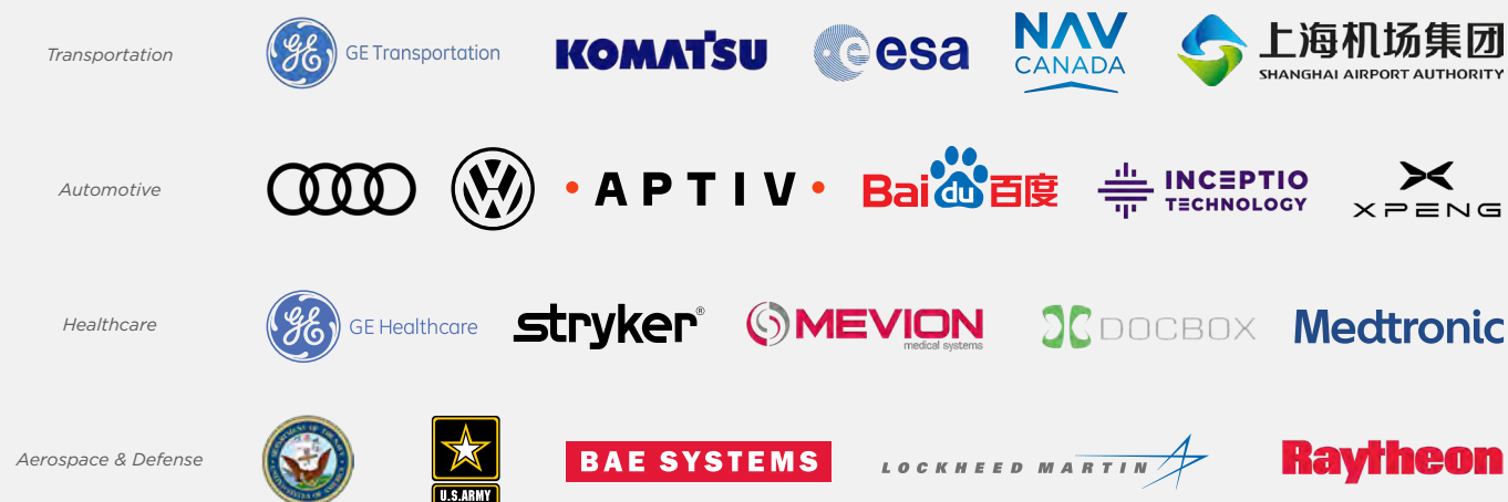
To manage complex communications on land, by air, underwater and in outer space, these organizations rely on RTI Connex

*Free trial is only available for Linux and Windows on Intel processors.